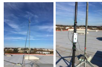
Telescopic perch AFV0087PT