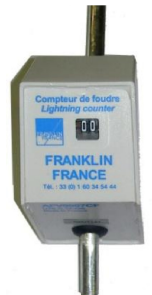
Lightning counter AFV0907CF