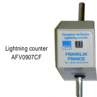
Lightning counter AFV0907CF