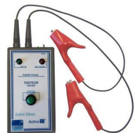
Wired tester AFV0050TT

This tester power supply operates with a battery (provided). The display with indicator lights indicates instantly the obtained result (positive or negative).