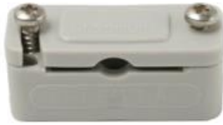
Delivered with 2 inox screws Ø4mm